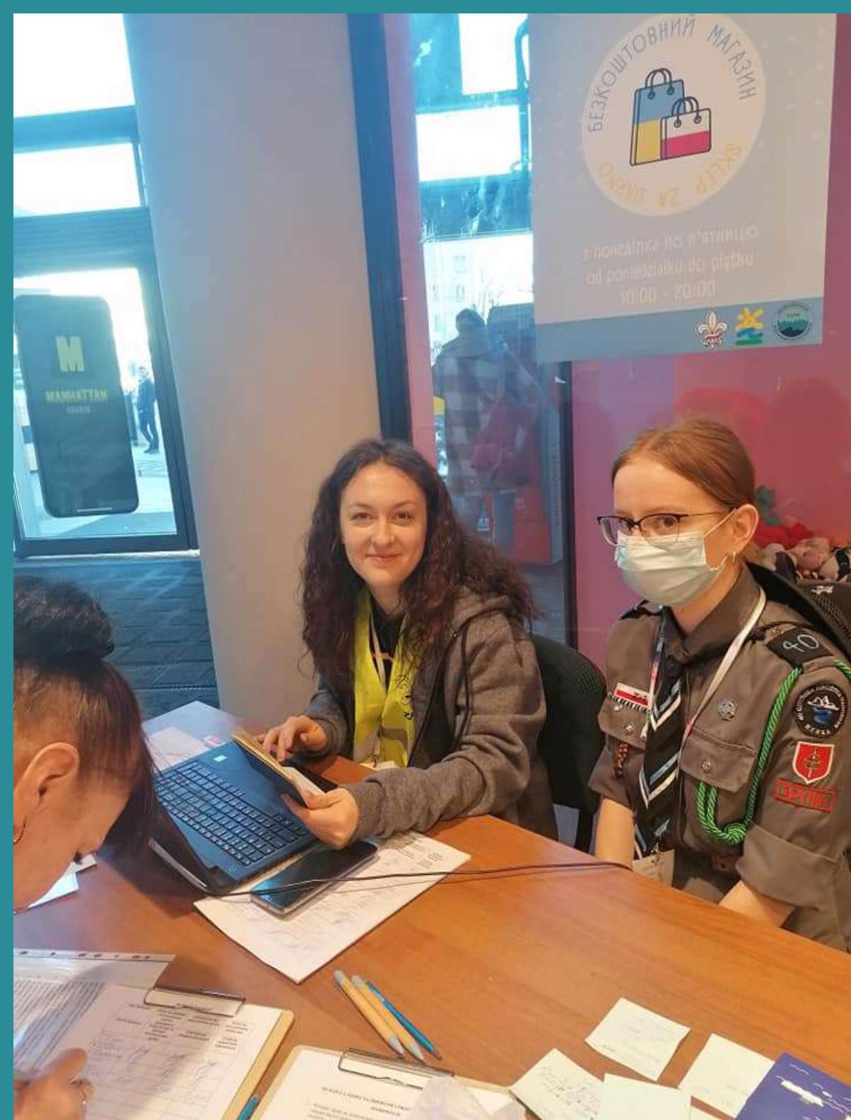
Our volunteers in "Shop for Free" providing humanitarian help for Ukrainians