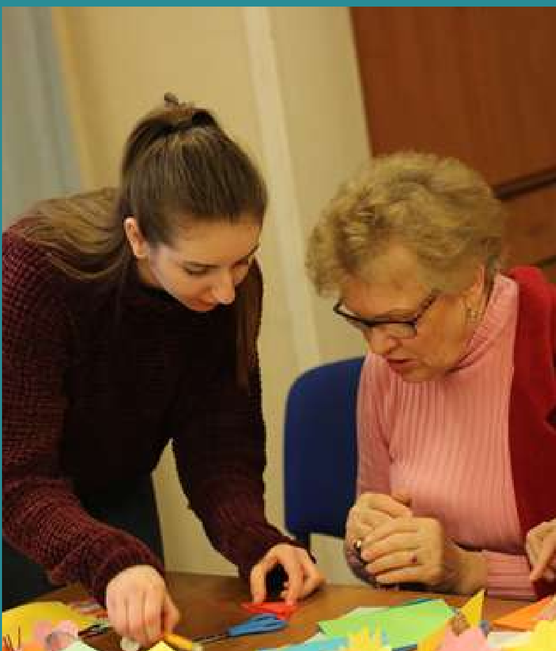
Workshops for the Neighbourhood House

The volunteer will receive the Info Kit where he/she can find all the information regarding the Hosting Organization, invitation letter, accommodation, financial conditions, transportation, contacts of coordinator and mentor and information about the city.